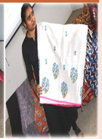
The Department of Home Science students have organized awareness program on National Handloom Day at MTWU Research and Extension Centre, Coimbatore.