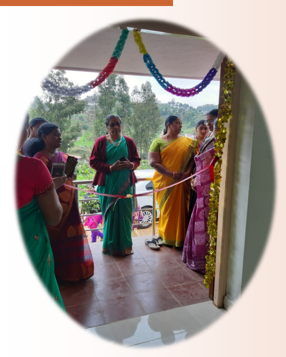
Inauguration of Computer Centre in Mother Teresa Women's University, Attuvampatty campus, Kodaikanal.