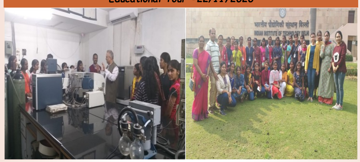
The Department of Chemistry organized a one week Educational Tour to New Delhi.