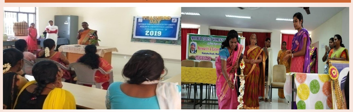
57th Teacher's Day Celebration at MTWU Chennai and Madurai Campus.