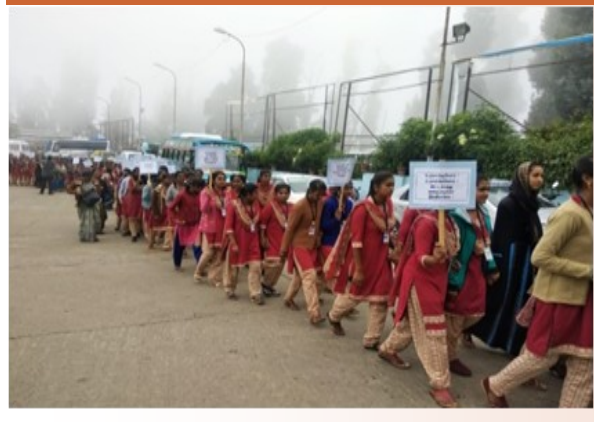
NSS Day Celebration was observed. The NSS Volunteers of Mother Teresa Women's University went on a rally.