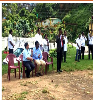
As an Action Plan for celebrating 150th Birth Anniversary of Mahatama Gandhi, a massive rally to generate awareness on the avoidance of single use plastics among the public was conducted.