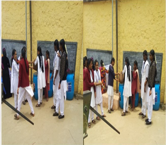
In lieu of FIT India Movement, the NSS volunteers of MTWU actively participated in picking up the used plastics lying on the road, and dropped them in dustbin.