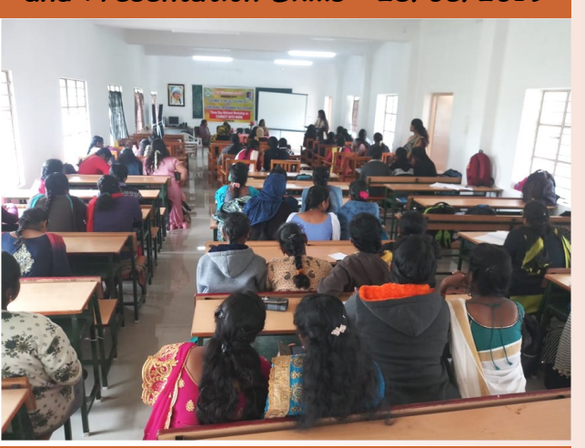
Group Discussion and Mock Interview 29/08/2019