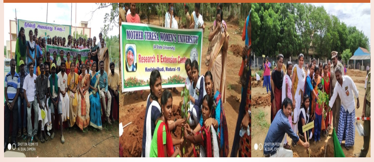
The students of Commerce and Education Departments planted more than 100 trees on both sides of Usilam Patti road started from SVN College Madurai. The program was organized by the Tamil Vanam Organization .