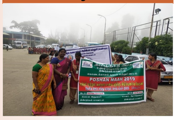
The NSS team organized a rally for Poshan Maah Program to create awareness on malnutrition's harmful impacts on young children. Nearly 170 students participated in the rally.