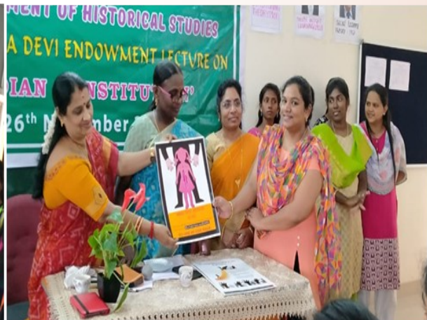
The Students of M.A Mass Communication created awareness posters on Child abuse, Domestic violence, Good touch and Bad Touch, Women Empowerment on Constitution day.